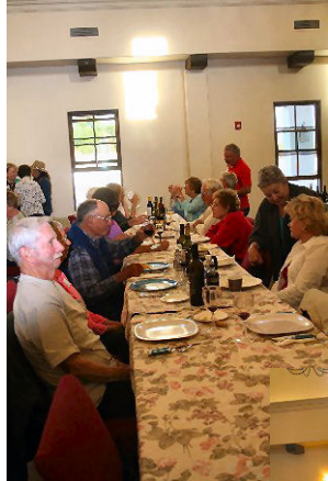
Shots from around the room

First, I want to thank everyone who told me our last social was the best ever. Your support means a lot to me. 85 of us enjoyed a fabulous evening at the San Miguel Parish Center. We had a great location, plenty of wonderful food, and of course, the best people in the world. I look forward to seeing every one at the June Social at Rio Seco. On another note, my serving utensil box is getting fuller. If you are missing serving utensils, check it out